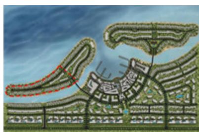
Portion of island visible in aerial photographs is outlined in red