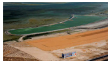
White Bay, Umm Al Quwain

On the mainland, roading works are also underway. Preparations for the villa foundations are nearly completed, and it is expected that the display villa is completed and open to the public by the end of the year.